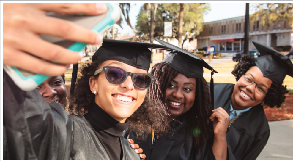
More than 90 percent of Savannah State students receive some form of scholarship or financial aid.