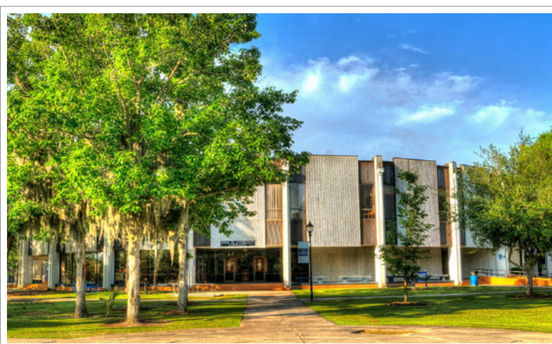
Asa H. Gordon Library